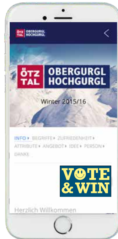
Vote & Win