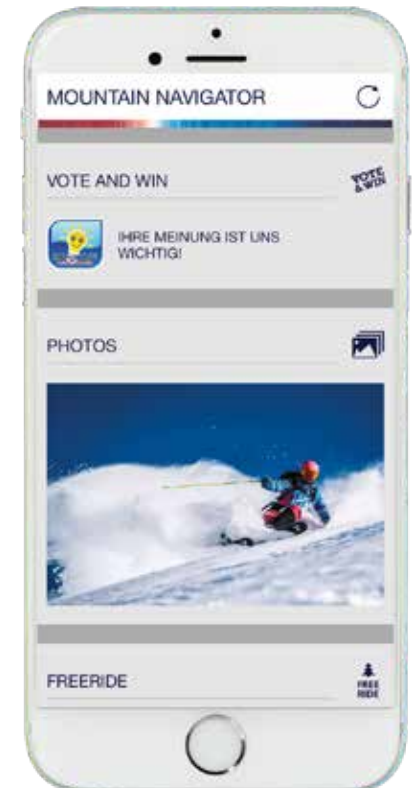
Photo function / Web links